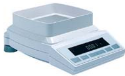
Milligram balance with draft shield