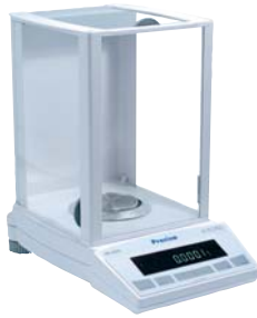
Analytical balance with three doors draft shield