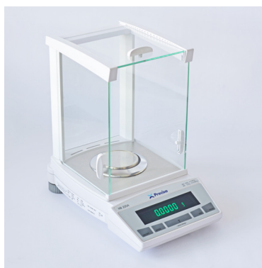
Series 320 XB BB